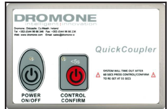
FIGURE 1.2 - DROMONE CONTROL BOX

HARTLAND BRANCH 96 McLean Avenue Hartland, New Brunswick E7P 2K5 Canada