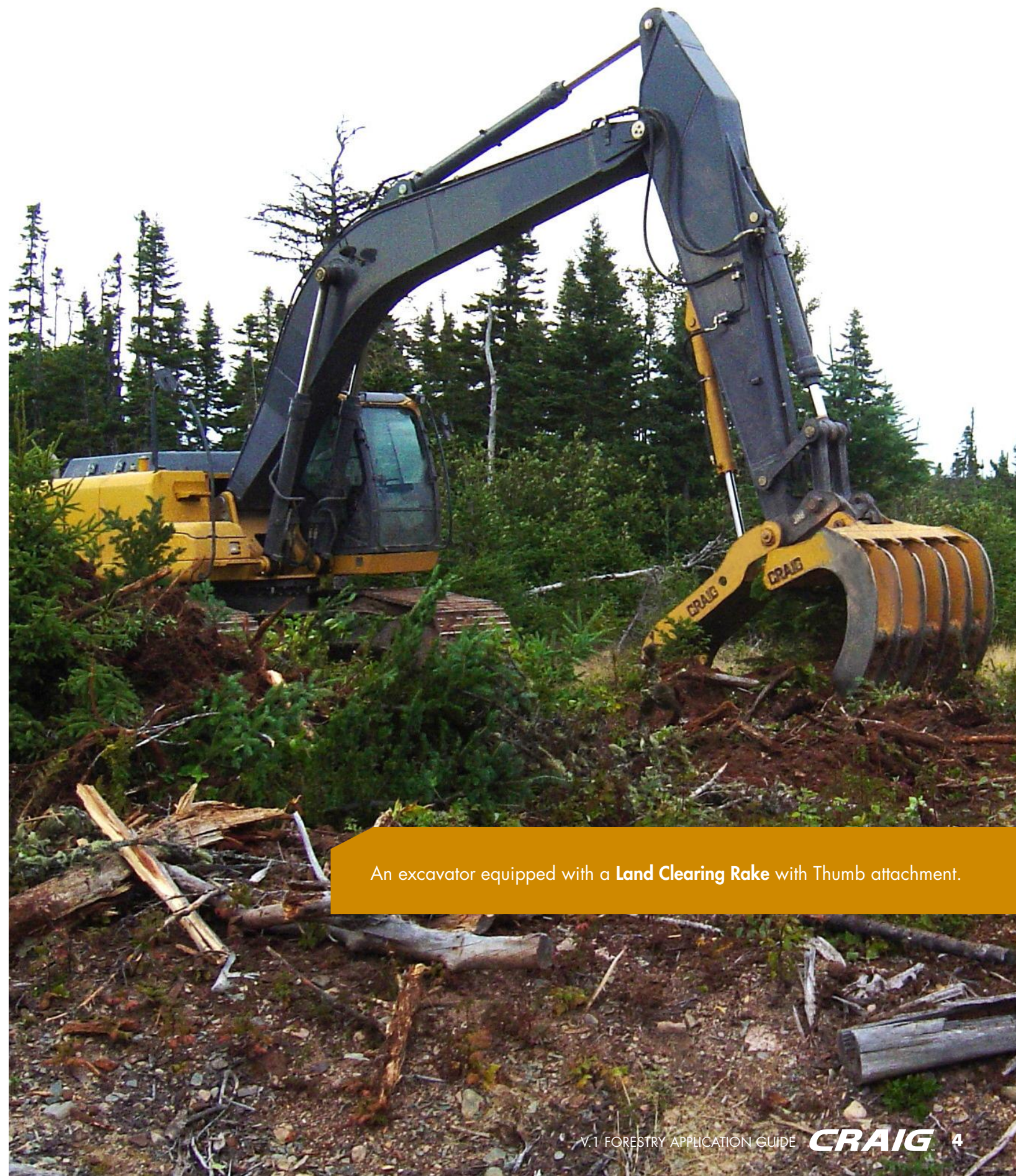
An excavator equipped with a Land Clearing Rake with Thumb attachment.

More than just a frost tooth, the Craig Ripper Tooth is designed for extra heavy duty applications where other rippers fail. Engineered for maximum penetration, the double reinforced shank joins a gusseted, boxed, lugging plate for unparalleled strength.